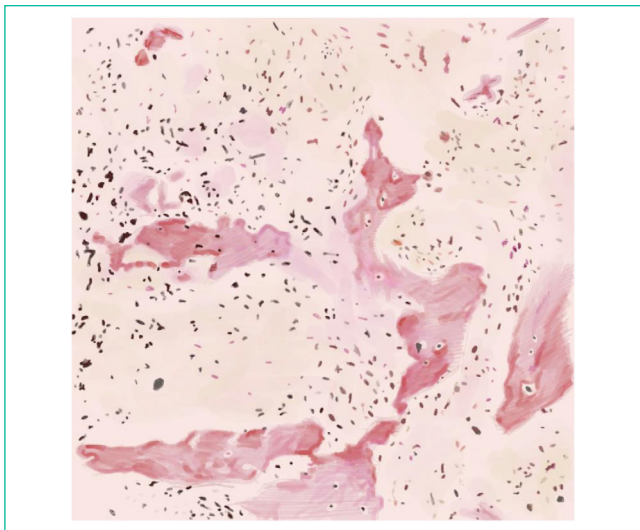
Figure 1. Histological image of ossifying fibroma of the jaws. Area of cellular fibrous tissue with focal deposits of newly formed abnormal bone-like material.