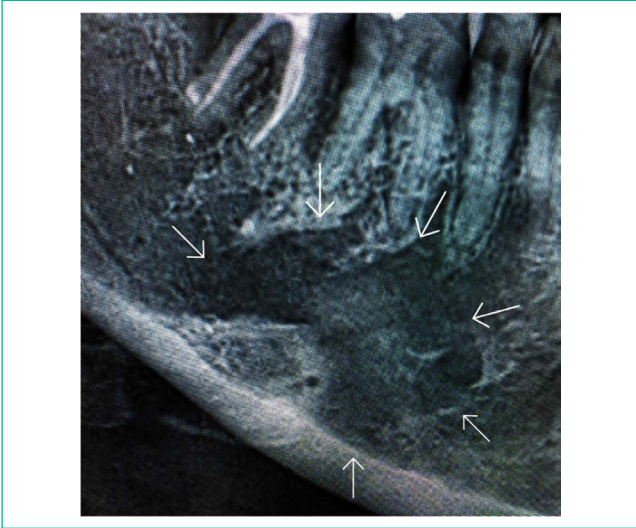
Figure 3. Radiographic image of ossifying fibroma in the right posterior area of the mandible. A well-demarcated unilateral lucent lesion (white arrows) without destructive features or root resorption can be seen in the area of molars-premolars.

contrast to the sporadic variants that are usually revealed after the 4 th decade of life, ossifying fibromas related to the syndrome have an average onset age of 30 years 19,26,39 . In fact, the earliest age reported is 10 years 19 . CDC73 gene mutations are rarely found in sporadic fibromas and seem to play a minor role in their initiation, whereas the vast majority of syndromic-related jaw tumors (80%) is positive for genetic mutations 19,26,40 . Li et al, interestingly, highlight that probands harboring a high-impact germline mutation present a higher risk of developing ossifying fibromas than those with low-impact mutations 12 .